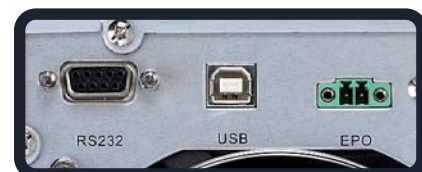
External communications/emergency shutdown ports

EMD (Environmental Monitoring Device) in order to operate it is necessary to SNMP installed