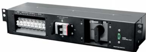
Maintenance Bypass Switch