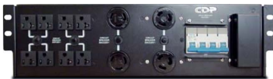
Compatible with power distribution unit (PDU) sold separately

- Communication cards contact for remote monitoring .